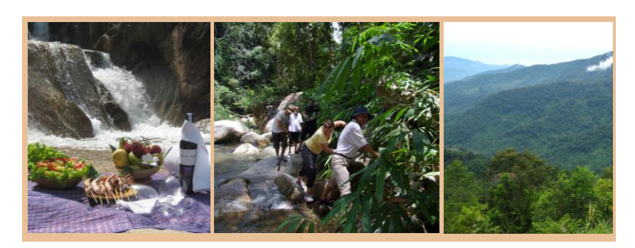
Option 2: for strong and adventurous

It is not a short hike like in a first option, it is a hiking deep into the real jungle - adventures and challenging way through lianas and indigenous flora, crossing the fast stream and climbing up to the imposing secret waterfall, the perfect peaceful place for the refreshment in the pure mountain spring water. The amazing barbeque prepared by our restaurant team and cooked by the tender guide on the rocks deep in the Vietnamese forest beside the waterfall for your unique lunch.